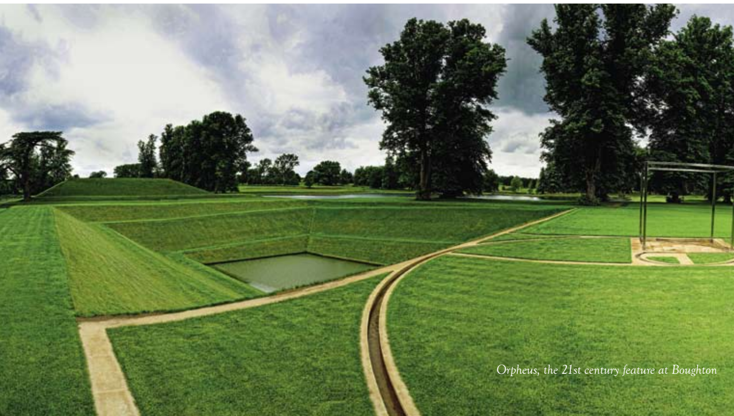
Orpheus, the 21st century feature at Boughton

I confirm I am a UK Tax payer and Gift Aid can be claimed on my donation