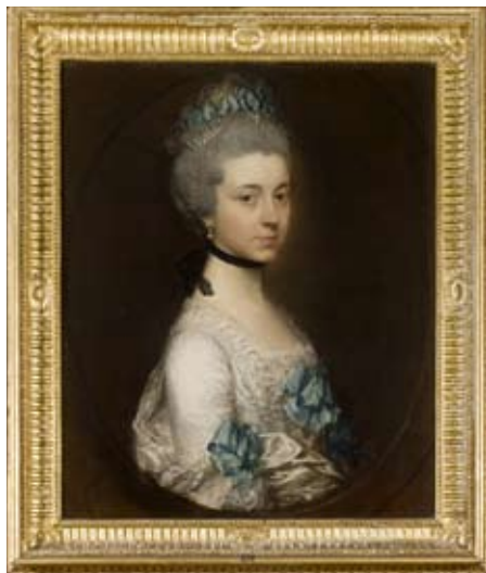
Elizabeth Montagu, Duchess of Buccleuch, By Thomas Gainsborough