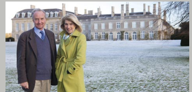
Duke of Buccleuch with Selina Scott for Treasure Houses of Britain .

Entry is free with a House and Gardens ticket or £3 for those visiting the gardens.